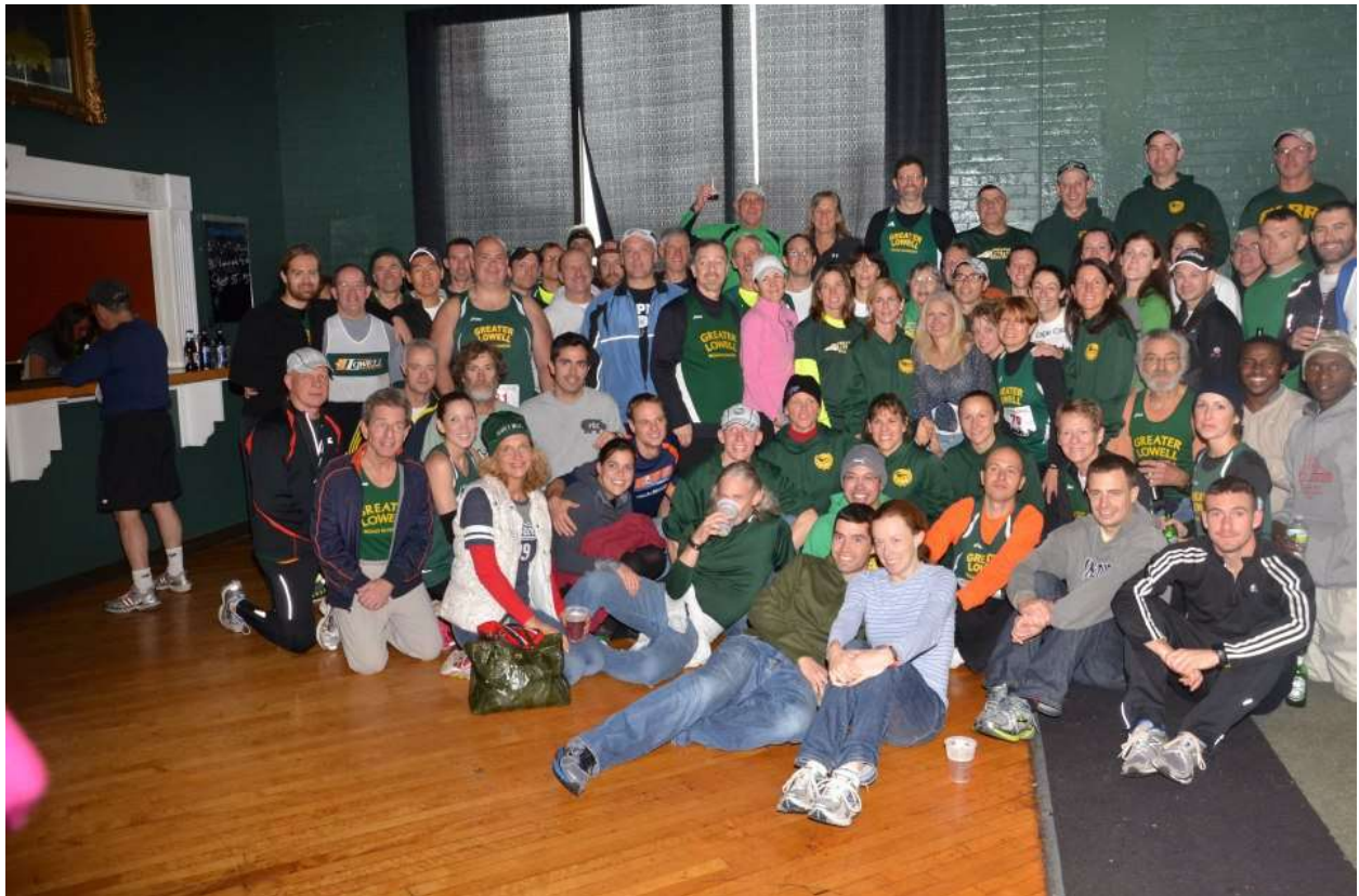
Picture of 2012 GLRR Mill Cities Relay squad.

On December 2 nd , GLRR participated in the Mill Cities relay, which involves multiple teams running 5 legs of a 26.9 mile course along the Merrimack River from Nashua, NH to Lawrence, MA. GLRR had its most successful Mill Cities Relay in several years and finished 3 rd amongst 19 local running clubs in a competition that helps to define who has the fastest running club north of Boston. There are a variety of categories based on age group and gender, and our club fielded teams in almost every category. The club finished with 106 points. This was only three