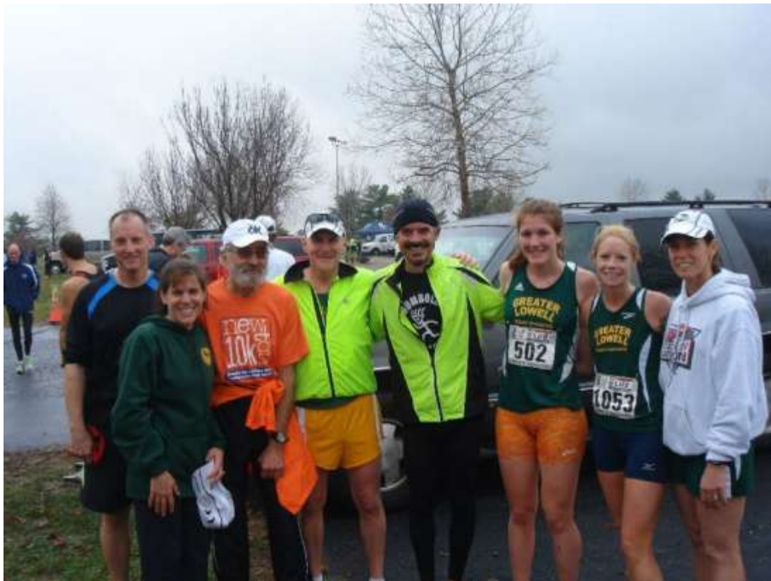
Below: Assorted GLRR team members at Lexington, KY.