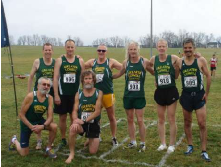
Above: the GLRR Men's team at Lexington, KY.