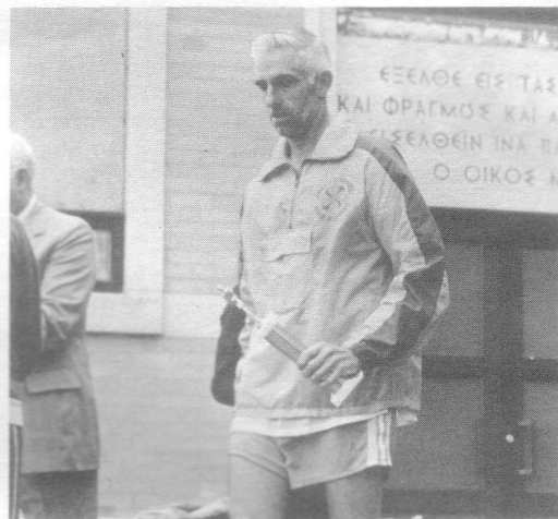
"It's all Greek to me"