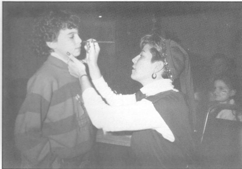
Face painting was a popular activity at this past GLRR children's Christmas Party